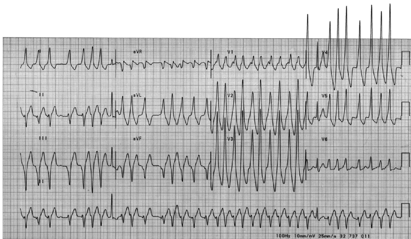
Figure 2. Rapid Ventricular Pre-Excitation